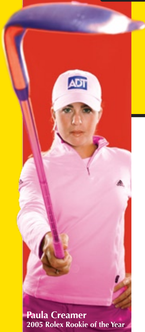
Paula Creamer 2005 Rolex Rookie of the Year

Annika Sorenstam – the world's most dominant golfer; U.S. Solheim Cup team's spectacular victory over Europe at Crooked Stick Golf Club; dominance of seasoned veterans Rosie Jones, Juli Inkster, Meg Mallon, Beth Daniel and Karrie Webb ; emergence of LPGA stars Cristie Kerr, Lorena Ochoa and Christina Kim ; teen sensation Paula Creamer leading nine Rolex First-Time Winners on Tour in 2005.